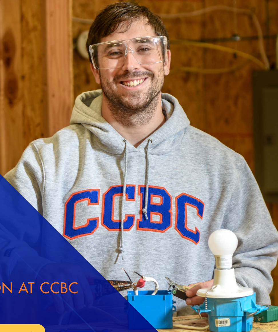
Chart your course to a rewarding career →